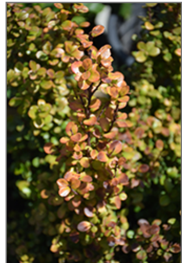
African Boxwood foliage