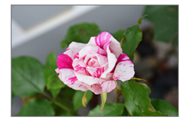
Julio Iglesias Rose flowers