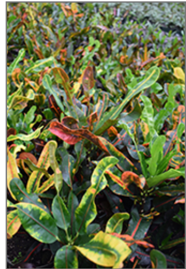
Mammy Croton in full

This is a dense herbaceous evergreen houseplant with an upright spreading habit of growth. Its wonderfully bold, coarse texture is quite ornamental and should be used to full effect. This plant should not require much pruning, except when necessary to keep it looking its best.