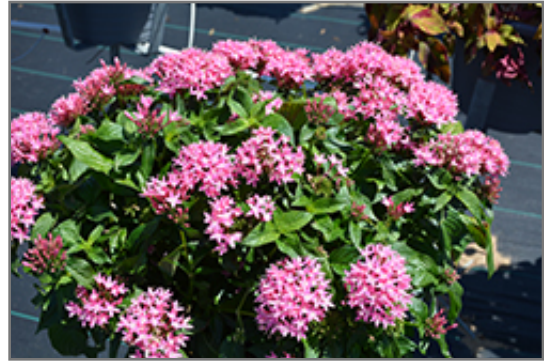
Lucky Star Deep Pink Star Flower in bloom

Lucky Star Deep Pink Star Flower will grow to be about 12 inches tall at maturity, with a spread of 14 inches. When grown in masses or used as a bedding plant, individual plants should be spaced approximately 10 inches apart. Its foliage tends to remain dense right to the ground, not requiring facer plants in front. This fast-growing annual will normally live for one full growing season, needing replacement the following year.