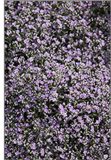
Sea Lavender flowers