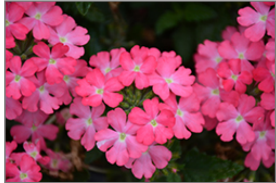
Firehouse Pink Verbena flowers

Firehouse Pink Verbena is recommended for the following landscape applications;