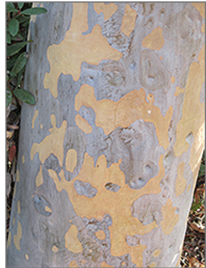
Lemon-scented Gum bark

This tree should only be grown in full sunlight. It prefers dry to average moisture levels with very well-drained soil, and will often die in standing water. It is particular about its soil conditions, with a strong preference for sandy, acidic soils, and is able to handle environmental salt. It is somewhat tolerant of urban pollution. This species is not originally from North America.