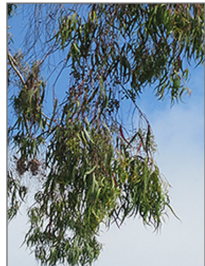
Lemon-scented Gum foliage