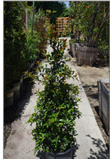
Monterey Bay Brush Cherry