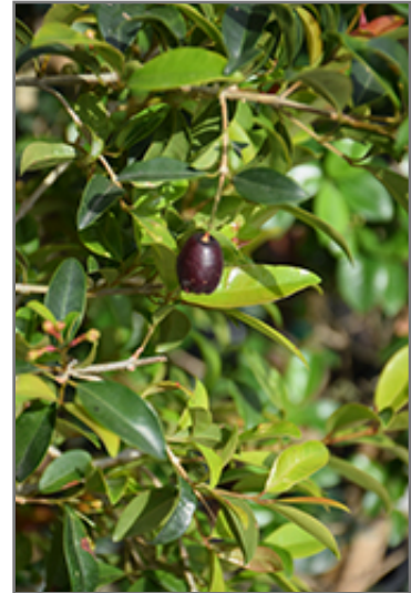
Monterey Bay Brush Cherry fruit

Monterey Bay Brush Cherry is a fine choice for the yard, but it is also a good selection for planting in outdoor pots and containers. Its large size and upright habit of growth lend it for use as a solitary accent, or in a composition surrounded by smaller plants around the base and those that spill over the edges. It is even sizeable enough that it can be grown alone in a suitable container. Note that when grown in a container, it may not perform exactly as indicated on the tag - this is to be expected. Also note that when growing plants in outdoor containers and baskets, they may require more frequent waterings than they would in the yard or garden.