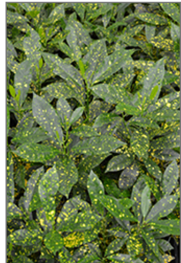
Gold Dust Variegated Croton foliage