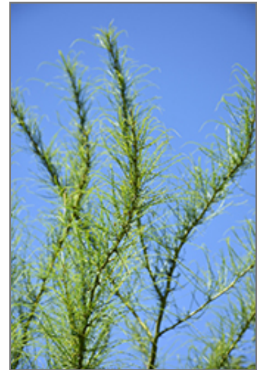
Mexican Palo Verde foliage

This tree does best in full sun to partial shade. It prefers dry to average moisture levels with very well-drained soil, and will often die in standing water. It is considered to be drought-tolerant, and thus makes an ideal choice for xeriscaping or the moisture-conserving landscape. It is not particular as to soil type or pH. It is somewhat tolerant of urban pollution. This species is native to parts of North America.