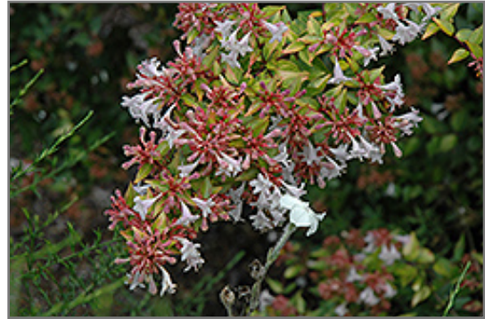
Francis Mason Abelia flowers

Francis Mason Abelia is recommended for the following landscape applications;