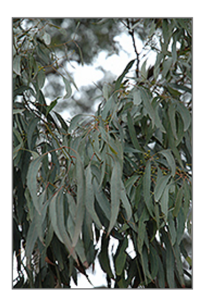
Tasmanian Blue Gum foliage