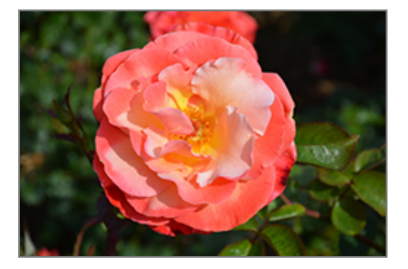
Colorific Rose flowers

A real showstopper, this rose produces striking blooms of peach, coral, and salmon, that mature to deeper tones of orange, scarlet and burgundy; impressive when massed in the garden; blooms repeat all season long and make splendid cut flowers