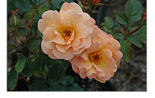
Colorific Rose flowers

27985 WICKERD RD. MENIFEE, CA 92584 951-679-7090 www.louiesnurserymenifee.com