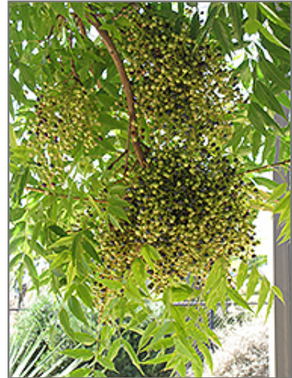
Chinese Pistache fruit

This tree should only be grown in full sunlight. It is very adaptable to both dry and moist growing conditions, but will not tolerate any standing water. It is not particular as to soil type or pH. It is highly tolerant of urban pollution and will even thrive in inner city environments. This species is not originally from North America.