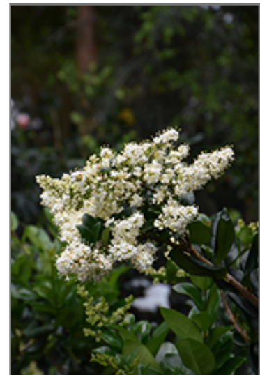
Japanese Privet flowers