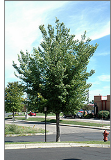
Common Hackberry