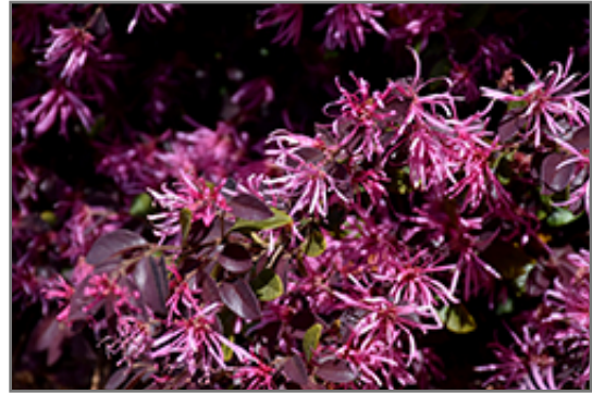
Razzleberri Fringeflower flowers

Razzleberri Fringeflower is recommended for the following landscape applications;