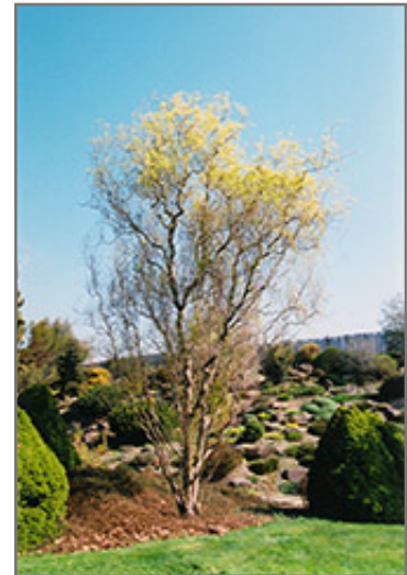
Dragon's Claw Willow in winter