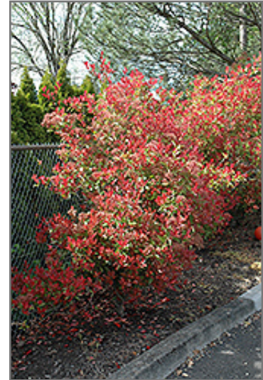
Fraser Photinia in bloom