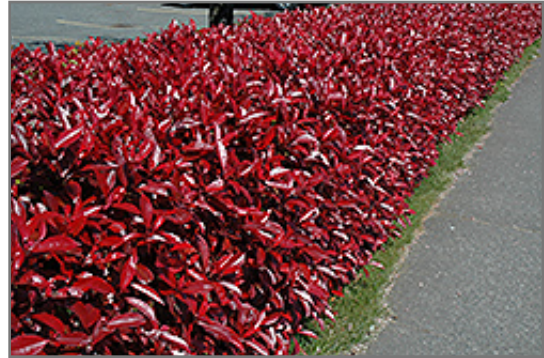
Fraser Photinia

Fraser Photinia will grow to be about 12 feet tall at maturity, with a spread of 7 feet. It tends to be a little leggy, with a typical clearance of 1 foot from the ground, and is suitable for planting under power lines. It grows at a fast rate, and under ideal conditions can be expected to live for 40 years or more.