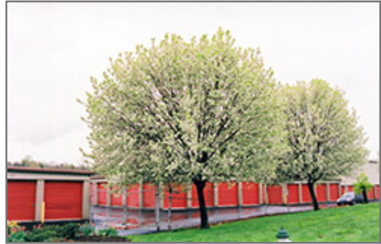
Bradford Ornamental Pear in bloom

Bradford Ornamental Pear is recommended for the following landscape applications;