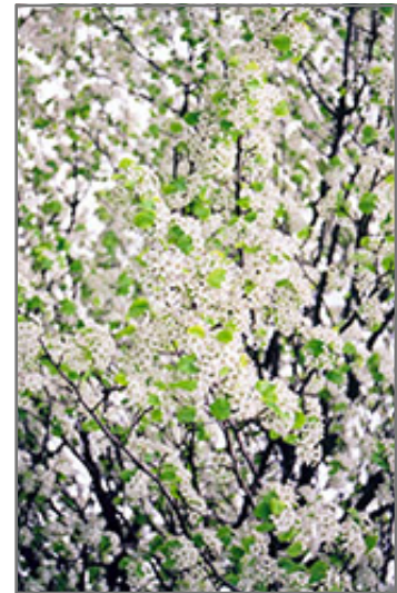
Bradford Ornamental Pear flowers