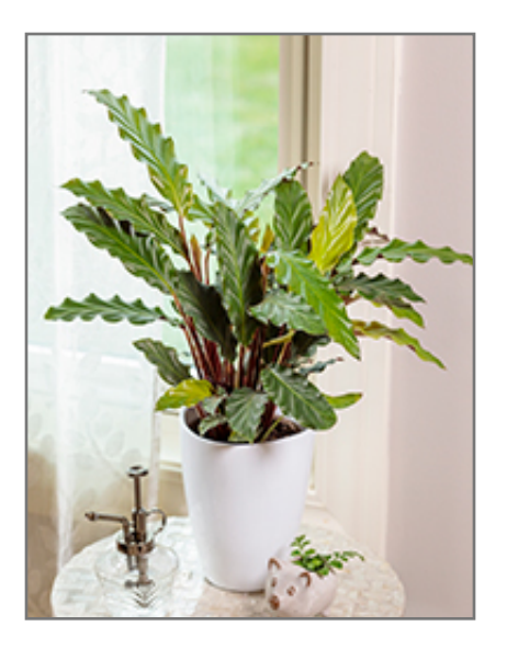
Color Full Rufibarba Furry Feather Calathea in full

27985 WICKERD RD. MENIFEE, CA 92584 951-679-7090 www.louiesnurserymenifee.com