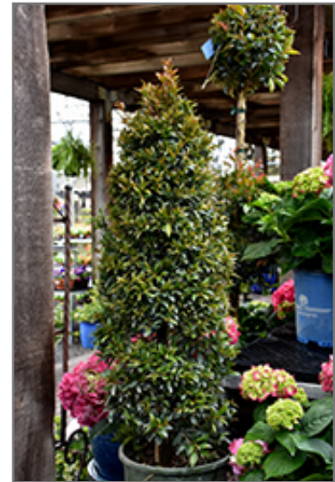
Dwarf Brush Cherry

Dwarf Brush Cherry is recommended for the following landscape applications;