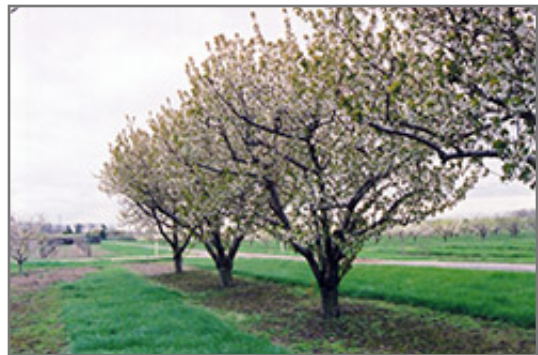
Sweet Cherry in bloom