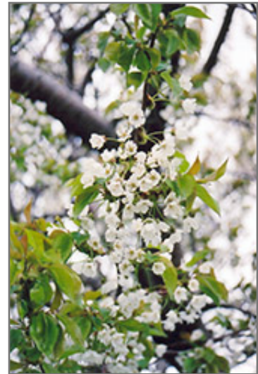
Sweet Cherry flowers

Sweet Cherry is covered in stunning clusters of fragrant white flowers hanging below the branches in early spring before the leaves. It has dark green deciduous foliage. The pointy leaves turn yellow in fall. The fruits are showy red drupes carried in abundance in mid summer. The fruit can be messy if allowed to drop on the lawn or walkways, and may require occasional clean-up. The smooth dark red bark adds an interesting dimension to the landscape.