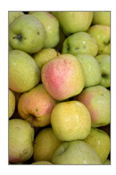
Dorsett Golden Apple fruit

Dorsett Golden Apple features showy clusters of lightly-scented white flowers with shell pink overtones along the branches from early to mid spring, which emerge from distinctive pink flower buds. It has forest green deciduous foliage. The pointy leaves turn yellow in fall. The fruits are showy light green apples with a rose blush and which fade to chartreuse over time, which are carried in abundance in mid summer. The fruit can be messy if allowed to drop on the lawn or walkways, and may require occasional clean-up.