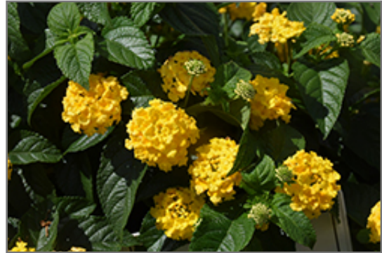
Lucky Yellow Lantana flowers

Lucky Yellow Lantana is recommended for the following landscape applications;