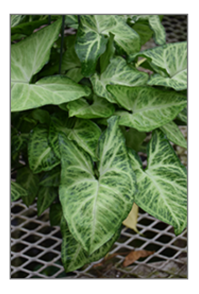
Falling Arrows White Butterfly Arrowhead Vine foliage