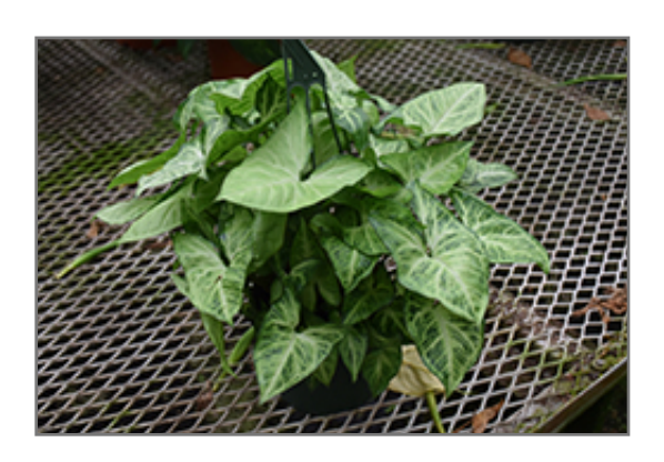
Falling Arrows White Butterfly Arrowhead Vine in full

This is an herbaceous evergreen houseplant with a trailing habit of growth, eventually spilling over the edges of hanging baskets and containers. This plant can be pruned at any time to keep it looking its best.