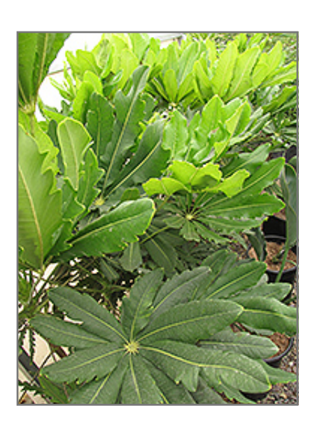
False Aralia foliage

When grown indoors, False Aralia can be expected to grow to be about 5 feet tall at maturity, with a spread of 24 inches. It grows at a medium rate, and under ideal conditions can be expected to live for approximately 10 years. This houseplant will do well in a location that gets either direct or indirect sunlight, although it will usually require a more brightly-lit environment than what artificial indoor lighting alone can provide. It prefers to grow in average to moist soil. The surface of the soil shouldn't be allowed to dry out completely, and so you should expect to water this plant once and possibly even twice each week. Be aware that your particular watering schedule may vary depending on its location in the room, the pot size, plant size and other conditions; if in doubt, ask one of our experts in the store for advice. It is not particular as to soil type or pH; an average potting soil should work just fine. Be warned that parts of this plant are known to be toxic to humans and animals, so special care should be exercised if growing it around children and pets.