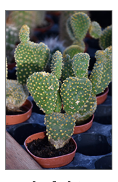
Bunny Ears Cactus

Bunny Ears Cactus is a small succulent evergreen plant. It is a member of the cactus family, which are grown primarily for their characteristic shapes, their interesting features and textures, and their high tolerance for hot, dry growing environments. As an 'opuntiad' type of cactus, it doesn't actually have leaves, but rather modified succulent stems that comprise the bulk of the plant, and which are designed to retain water for long periods of time. This particular cactus is valued for its upright and spreading habit of growth This plant has buttery yellow cup-shaped flowers at the ends of the stems in mid spring, which are interesting on close inspection.