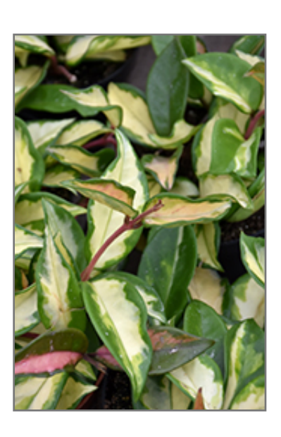
Variegated Wax Plant foliage

When grown indoors, Variegated Wax Plant can be expected to grow to be about 12 inches tall at maturity, with a spread of 5 feet. It grows at a medium rate, and under ideal conditions can be expected to live for approximately 10 years. This houseplant should be situated in a location that that gets indirect sunlight at most, although it will usually require a more brightly-lit environment than what artificial indoor lighting alone can provide. It is very adaptable to both dry and moist soil, but will not tolerate any standing water. The surface of the soil shouldn't be allowed to dry out completely, and so you should expect to water this plant once and possibly even twice each week. Be aware that your particular watering schedule may vary depending on its location in the room, the pot size, plant size and other conditions; if in doubt, ask one of our experts in the store for advice. It is not particular as to soil pH, but grows best in rich soil. Contact the store for specific recommendations on pre-mixed potting soil for this plant.