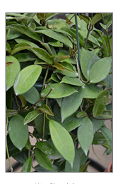
Wax Plant foliage

When grown indoors, Wax Plant can be expected to grow to be about 10 inches tall at maturity, with a spread of 4 feet. It grows at a medium rate, and under ideal conditions can be expected to live for approximately 10 years. This houseplant performs well in both bright or indirect sunlight and strong artificial light, and can therefore be situated in almost any well-lit room or location. It is very adaptable to both dry and moist soil, but will not tolerate any standing water. The surface of the soil shouldn't be allowed to dry out completely, and so you should expect to water this plant once and possibly even twice each week. Be aware that your particular watering schedule may vary depending on its location in the room, the pot size, plant size and other conditions; if in doubt, ask one of our experts in the store for advice. It is particular about its soil conditions, with a strong preference for rich, acidic soil. Contact the store for specific recommendations on pre-mixed potting soil for this plant.