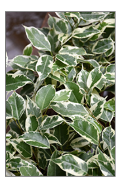
Starlight Weeping Fig foliage

When grown indoors, Starlight Weeping Fig can be expected to grow to be about 5 feet tall at maturity, with a spread of 3 feet. It grows at a medium rate, and under ideal conditions can be expected to live for approximately 50 years. This houseplant will do well in a location that gets either direct or indirect sunlight, although it will usually require a more brightly-lit environment than what artificial indoor lighting alone can provide. It does best in average to evenly moist soil, but will not tolerate standing water. The surface of the soil shouldn't be allowed to dry out completely, and so you should expect to water this plant once and possibly even twice each week. Be aware that your particular watering schedule may vary depending on its location in the room, the pot size, plant size and other conditions; if in doubt, ask one of our experts in the store for advice. It is not particular as to soil type or pH; an average potting soil should work just fine. Be warned that parts of this plant are known to be toxic to humans and animals, so special care should be exercised if growing it around children and pets.