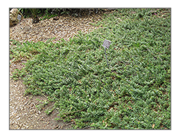
Fine-leaf Groundcover Myoporum

This shrub will require occasional maintenance and upkeep, and should only be pruned after flowering to avoid removing any of the current season's flowers. It is a good choice for attracting bees and butterflies to your yard. It has no significant negative characteristics.