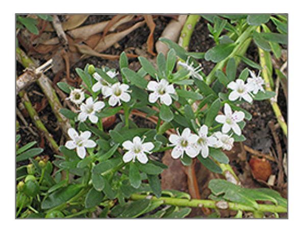
Fine-leaf Groundcover Myoporum flowers

Fine-leaf Groundcover Myoporum is a dense multi-stemmed evergreen shrub with a ground-hugging habit of growth. It lends an extremely fine and delicate texture to the landscape composition which should be used to full effect.