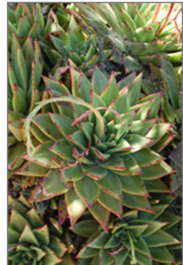
Molded Wax Echeveria foliage