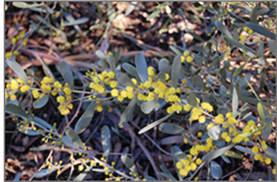
Low Boy Prostrate Acacia flowers

Low Boy Prostrate Acacia will grow to be about 24 inches tall at maturity, with a spread of 15 feet. It has a low canopy. It grows at a medium rate, and under ideal conditions can be expected to live for approximately 20 years.