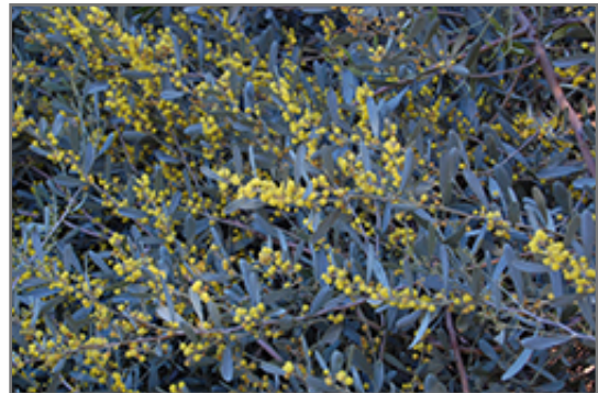
Low Boy Prostrate Acacia foliage