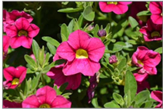
Calitastic Fancy Fuchsia Calibrachoa flowers

Calitastic Fancy Fuchsia Calibrachoa is recommended for the following landscape applications;