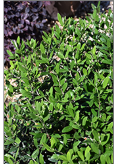
Little Ollie&reg Dwarf Olive foliage

Little Ollie&reg Dwarf Olive makes a fine choice for the outdoor landscape, but it is also well-suited for use in outdoor pots and containers. With its upright habit of growth, it is best suited for use as a 'thriller' in the 'spiller-thriller-filler' container combination; plant it near the center of the pot, surrounded by smaller plants and those that spill over the edges. It is even sizeable enough that it can be grown alone in a suitable container. Note that when grown in a container, it may not perform exactly as indicated on the tag - this is to be expected. Also note that when growing plants in outdoor containers and baskets, they may require more frequent waterings than they would in the yard or garden.