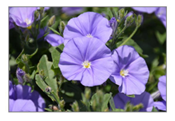
Manati Deep Blue Ground Morning Glory flowers

Manati Deep Blue Ground Morning Glory features showy sky blue trumpet-shaped flowers with yellow throats along the branches from mid spring to early fall. It has green evergreen foliage. The fuzzy round leaves remain green throughout the winter.