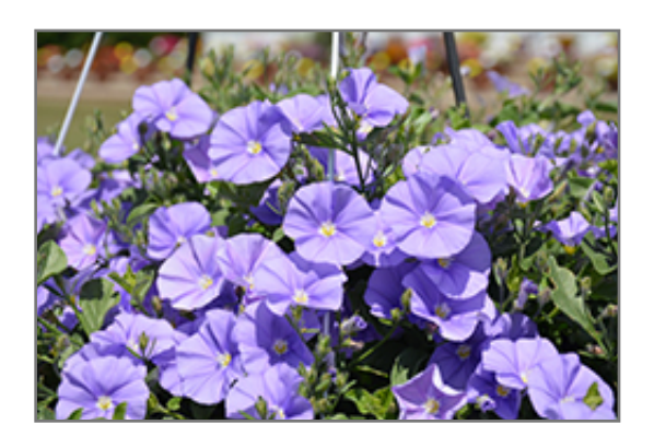
Manati Deep Blue Ground Morning Glory flowers