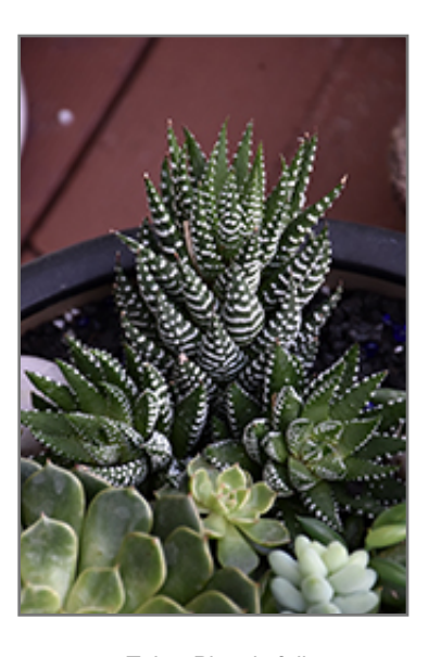
Zebra Plant in full

This is an herbaceous houseplant with a more or less rounded form. This plant should not require much pruning, except when necessary to keep it looking its best.