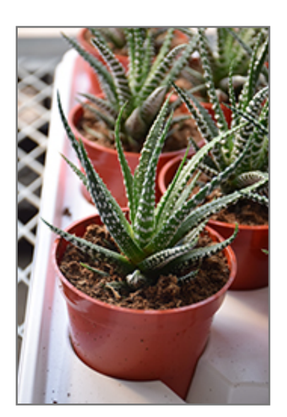
Zebra Plant in full