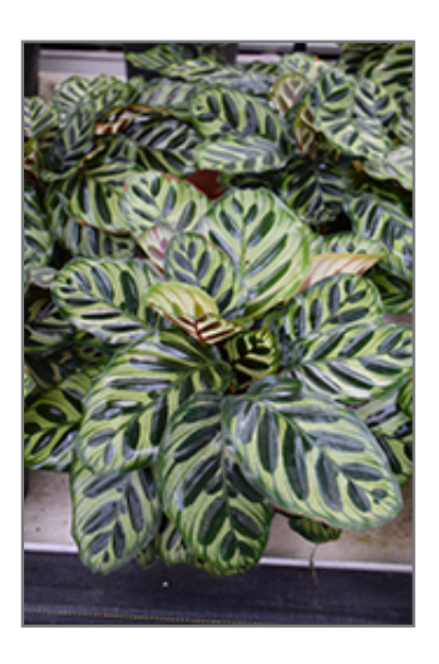
Peacock Plant in full

When grown indoors, Peacock Plant can be expected to grow to be about 24 inches tall at maturity, with a spread of 18 inches. It grows at a slow rate, and under ideal conditions can be expected to live for approximately 5 years. This houseplant should only be grown away from direct sunlight or in a room with strong artificial light. It does best in average to evenly moist soil, but will not tolerate standing water. The surface of the soil shouldn't be allowed to dry out completely, and so you should expect to water this plant once and possibly even twice each week. Be aware that your particular watering schedule may vary depending on its location in the room, the pot size, plant size and other conditions; if in doubt, ask one of our experts in the store for advice. It is not particular as to soil pH, but grows best in rich soil. Contact the store for specific recommendations on pre-mixed potting soil for this plant.