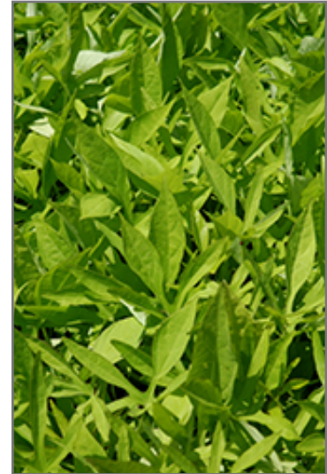
SolarPower Lime Sweet Potato Vine foliage