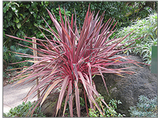
Electric Pink Cordyline

Electric Pink Cordyline is recommended for the following landscape applications;