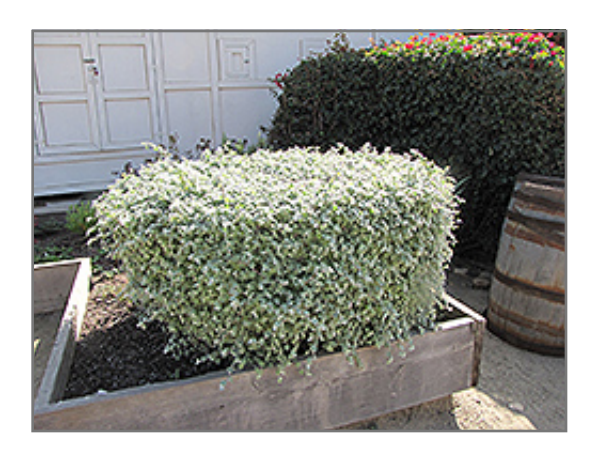
Licorice Plant

Licorice Plant is recommended for the following landscape applications;