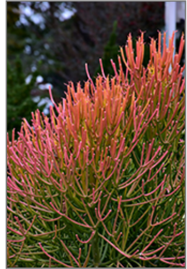
Sticks On Fire Red Pencil Tree foliage

Sticks On Fire Red Pencil Tree is recommended for the following landscape applications;