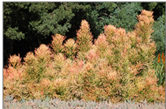
Sticks On Fire Red Pencil Tree