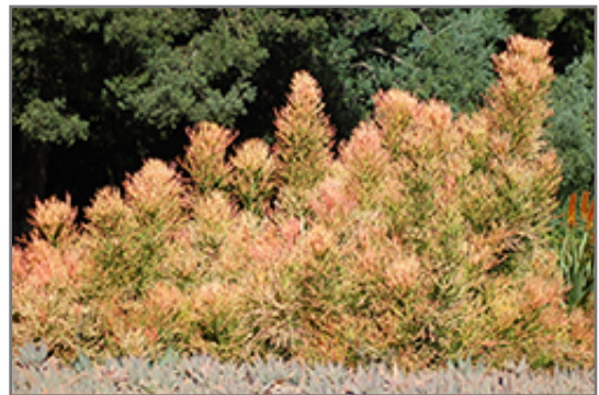
Sticks On Fire Red Pencil Tree