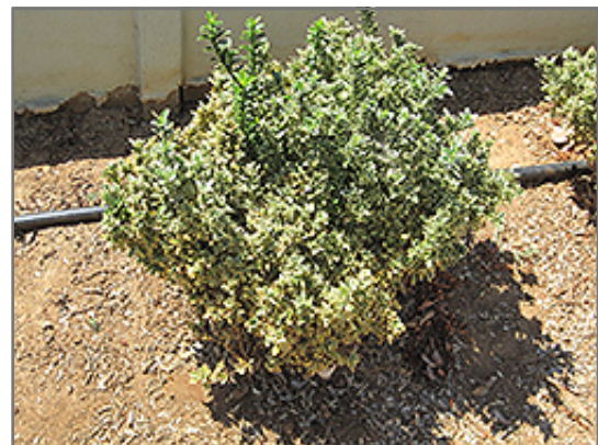
Variegated Boxleaf Japanese Euonymus