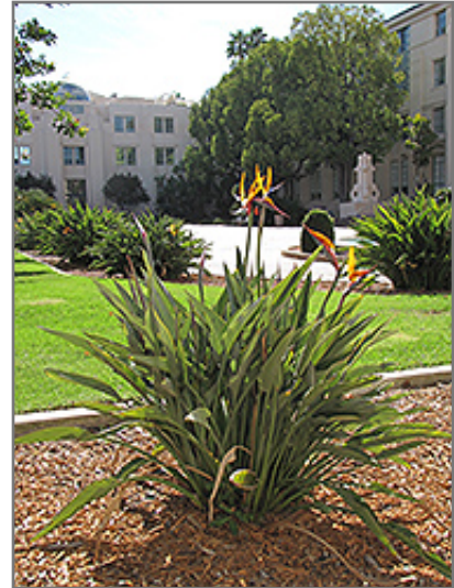
Orange Bird Of Paradise in bloom

Orange Bird Of Paradise is a fine choice for the garden, but it is also a good selection for planting in outdoor pots and containers. With its upright habit of growth, it is best suited for use as a 'thriller' in the 'spiller-thriller-filler' container combination; plant it near the center of the pot, surrounded by smaller plants and those that spill over the edges. It is even sizeable enough that it can be grown alone in a suitable container. Note that when growing plants in outdoor containers and baskets, they may require more frequent waterings than they would in the yard or garden.