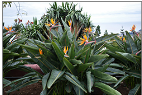
Orange Bird Of Paradise in bloom