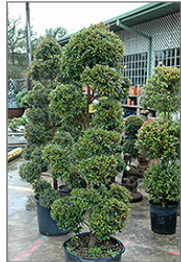
Brush Cherry

Brush Cherry is recommended for the following landscape applications;