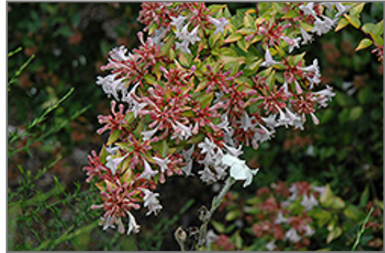
Francis Mason Abelia flowers

Francis Mason Abelia is recommended for the following landscape applications;