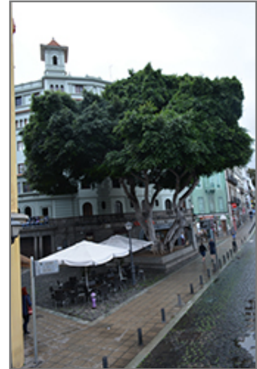
Indian Laurel Fig

This tree will require occasional maintenance and upkeep, and is best pruned in late winter once the threat of extreme cold has passed. It is a good choice for attracting birds to your yard, but is not particularly attractive to deer who tend to leave it alone in favor of tastier treats. It has no significant negative characteristics.