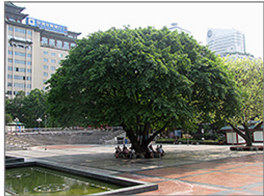
Indian Laurel Fig

Indian Laurel Fig will grow to be about 25 feet tall at maturity, with a spread of 25 feet. It has a low canopy with a typical clearance of 1 foot from the ground, and is suitable for planting under power lines. It grows at a medium rate, and under ideal conditions can be expected to live for 50 years or more.