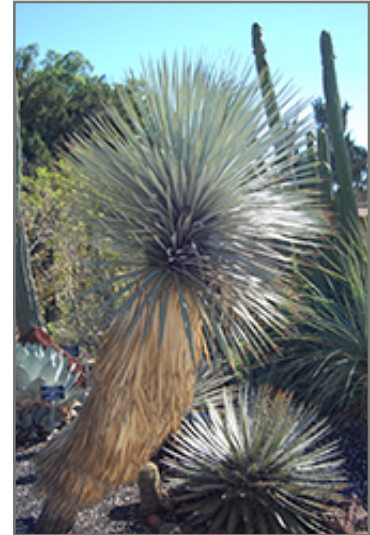
Beaked Yucca

Beaked Yucca is recommended for the following landscape applications;