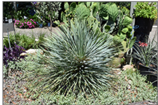
Beaked Yucca