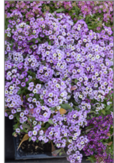
Clear Crystal Lavender Shades Sweet Alyssum flowers

Clear Crystal Lavender Shades Sweet Alyssum is recommended for the following landscape applications;